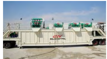
Dredge Slurry Dewatering