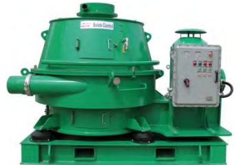
Vertical Cutting Dryer