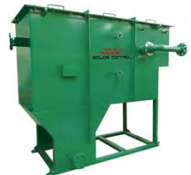
Oil Water Separator