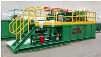
Mining Solids/ Liquid Separation