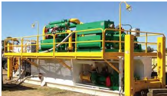
HDD & CBM