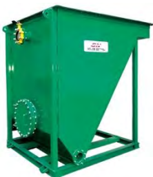
Inclined Plate Clarifier