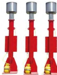
Electric Ignition Device