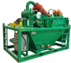
Bored Pile & TBM