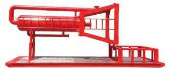
Mud Gas Separators