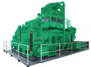
TBM Slurry Separation Plant