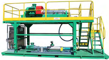
Drilling Waste Management

GN can design and build bespoke systems/units to cater for your exact requirements. With our in-house CAD design department, we work with you to refine the design, function and layout so that it fits your needs perfectly. Below is a snapshot of some of our products.